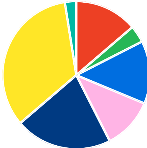
Percentage of Beavers who have completed the badges

● Adventure ● Outdoors ● Skills ● World ● Personal ● Teamwork ● Chief Scout's Bronze