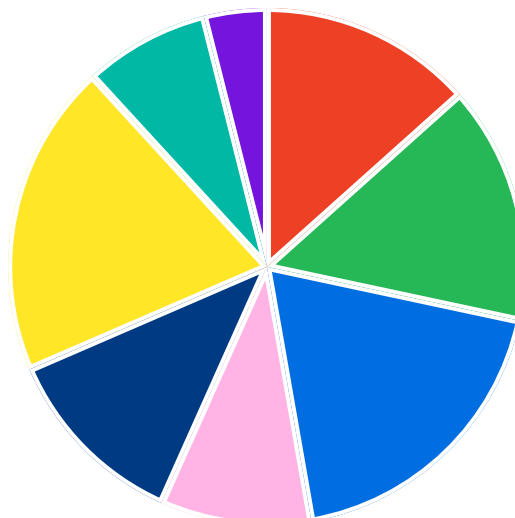
Percentage of Cubs who have completed the badges

● Adventure ● Outdoors ● Skills ● World ● Personal ● Teamwork ● Team Leader ● Chief Scout's Silver